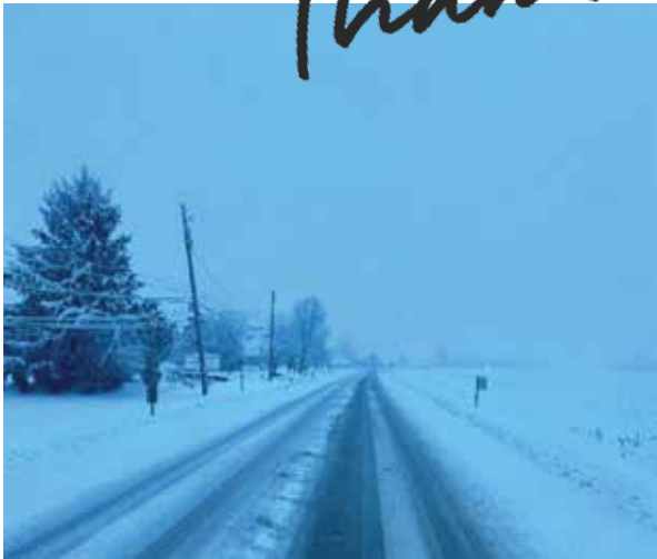
2025-2026 had a lot of heavy snow ...