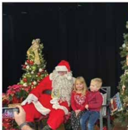
Families enjoying the Breakfast with Santa Event