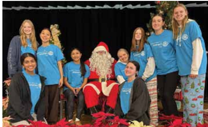
Santa with Interact Student Volunteers

On December 6, 2025, our Police Benevolent Association held its annual Breakfast with Santa at Franconia Elementary School to benefit Shop with a Cop. Every officer in the department contributed to the effort by either working on the event or covering the street. Many of our family members along with our friends from the Souderton Area High School Interact Club supported the day, which catered to approximately 500 hungry guests. It was incredibly fun spending time with so many great people! Of course, Santa was the star of the show, meeting and greeting hundreds of children. Over $3,000 was raised to support our annual Shop with a Cop Event.