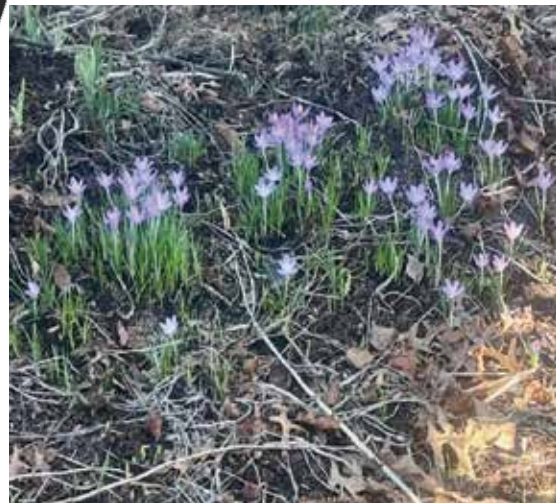
But Spring has sprung!!