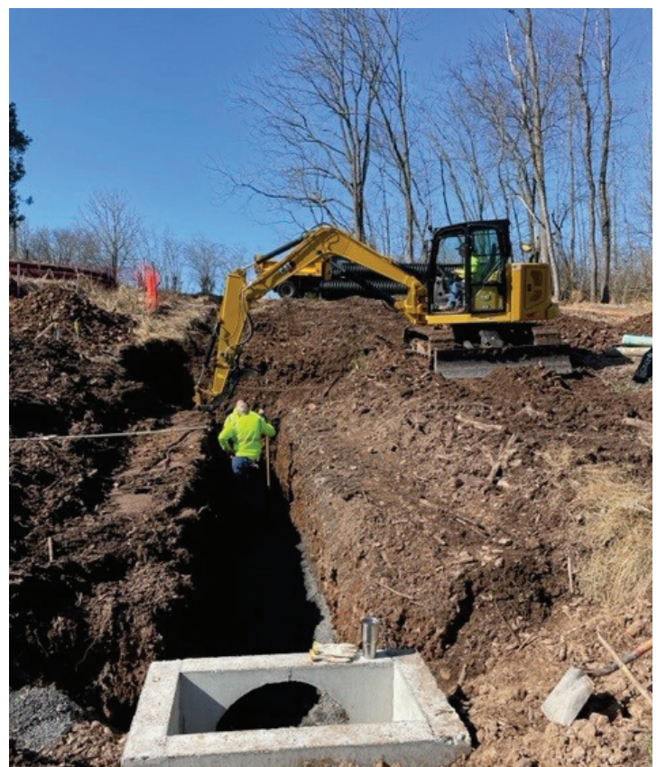
A new storm inlet is installed at Enos Godshall Park