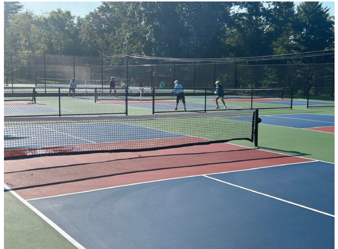
The pickleball courts at Branchwood Park are open

If you would like to view Ordinance 417-23, it can be found on the township website under Parks & Recreation.