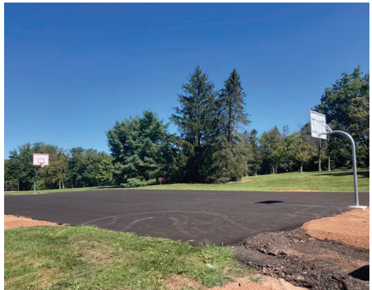
Branchwood Park basketball court under construction

As you drive around the Township, you can see and appreciate the beauty of our parks which is accomplished by the hard work performed by our public works' team.