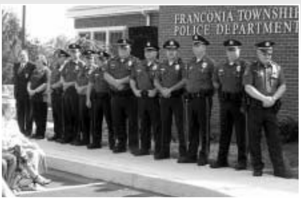
Members of the Franconia Township Police Department in attendance at the dedication ceremonies.

esidents of Franconia Township that have an interest in serving on a committee or other volunteer commission should submit a Volunteer Application form to the Township Manager. The township retains applications for a two-year period to fill vacancies as they occur. The township relies on volunteer residents to be part of the legislative committees that assist the Board of Supervisors in their decision making process. Support your township by being a volunteer!